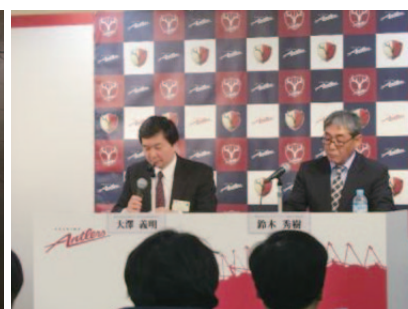
Alliance with Kashima Antlers