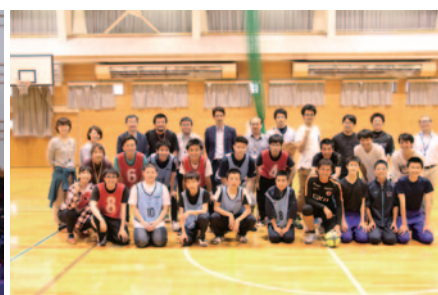
Football with Teshio Residents