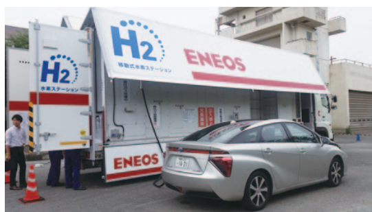
Research on H 2 Energy