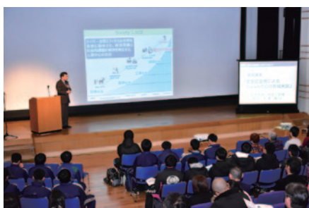
Joso-City 2019 Symposium