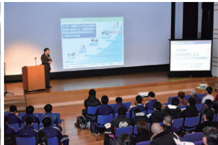
Joso-City 2019 Symposium