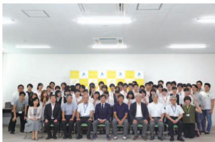
Cooperation Program with High Schools

In order to solve urban and regional problems, qualitative and interdisciplinary approaches are utilized. Regardless of existing academic theory or general analysis methods, theoretical methods (in some cases, we create them) are chosen based on characteristics of the region and the problem from practical and theoretical. Although research theme is general about city planning, recently, the followings topics are studied: mobile innovation and urban planning, civil infrastructure management and maintenance, tax competition and harmonization, efficiency of referendum, quantitative analysis of cityscape, wide-area cooperation among local governments, city planning with IoT, and sustainable system of local government.