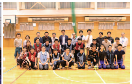
Football with Teshio Residents