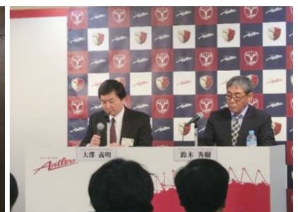
Alliance with Kashima Antlers