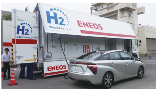
Research on H 2 Energy