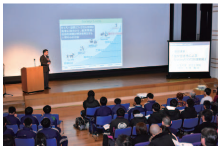
Joso - City 2019 Symposium